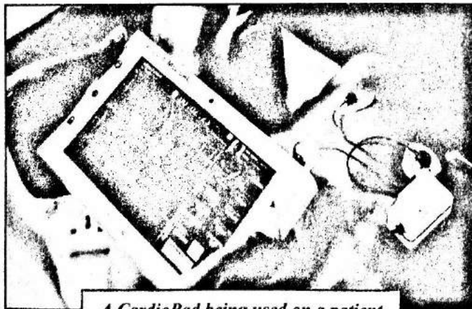
A CardioPad being used on a patient